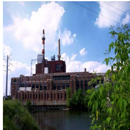
Fig. 2 – Crawford Generating Station Little Village

The owner of the plants, Midwest Generation, decided earlier this year to retire and decommission the generating stations. The stations shut down in August 2012, due in part to the advocacy activities of the Chicago Clean Power Coalition (see below) and in part to market realities. When the plants closed, around 175 jobs – predominantly union – were lost from these sites. Midwest Generation will decide what happens to the sites now that the generating stations are closed. The company is legally obliged to ‘secure and maintain’ the sites, but any additional redevelopment is voluntary. However, together with the Fisk and Crawford Reuse Task Force, Midwest Generation is actively exploring options for reclamation and redevelopment of the sites by itself or a third party. The company believes that reclamation and economic development as soon as economically practical is desirable, as are uses of the sites that are supported by the City and surrounding communities.