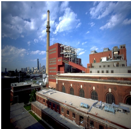
Fig. 1 – Fisk Generating Station Pilsen

Fisk, located on a 43 acre site at 1111 W. Cermak in Pilsen, has generated electricity from coal-burning turbines since 1903. Its 326 MW capacity can produce enough electricity to power over 380,000 households. The site is also home to six natural gas-fired peaking plants and to ComEd transmission and distribution equipment. Crawford, located on a 72-acre site at 3501 S. Pulaski in Little Village, is newer – commissioned in 1925 – and larger, with a 542 MW rated capacity. ComEd transmission and distribution equipment is also located on the Crawford site.